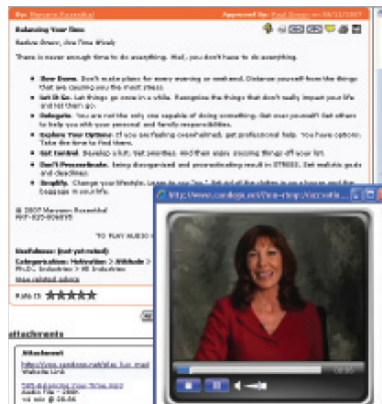
CanDoGo™ Insights: Get on-demand sales and professional coaching from the experts.

With busy schedules, you can't spend time in out-of-office training, reading books, or sometimes even going to managers for guidance. CanDoGo Insights™ are now delivered to you directly inside Maximizer CRM—small, relevant sound bites of knowledge that instantly answer your business questions. This is Know How Now! ™. The advice and coaching is served up on-demand in text, audio and video formats, so you can choose the format most appropriate to your needs.